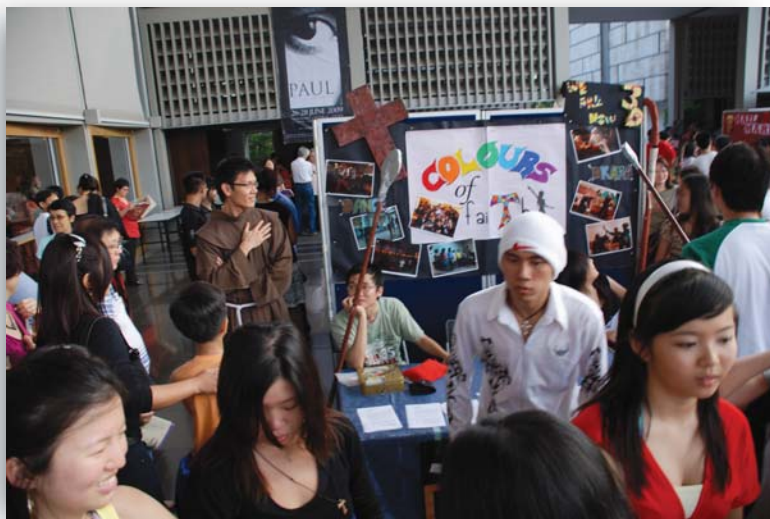
Youth Exhibition 2009 at St Mary of the Angels Church.